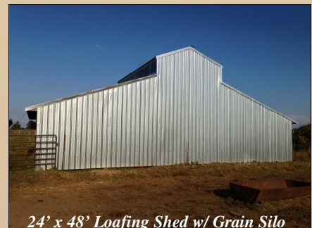
24' x 48' Loafing Shed w/ Grain Silo