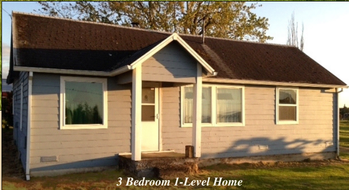
3 Bedroom 1-Level Home