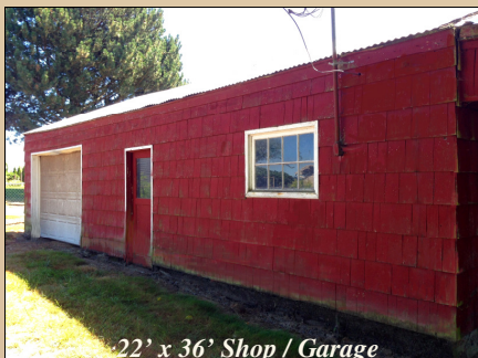
22' x 36' Shop / Garage

RMLS #13479982 / More At: CanbyHomes.com